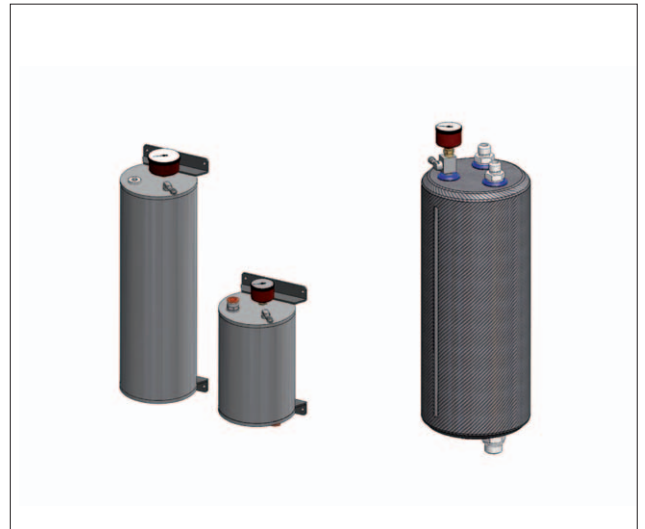
Standard pressurized oil tanks, 2 and 4 litres volume