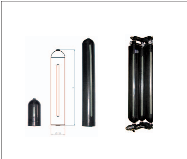
Carbon fibre oil tanks: 2,5 and 9 litres volume. On the right: custom arrangements for VOR 70